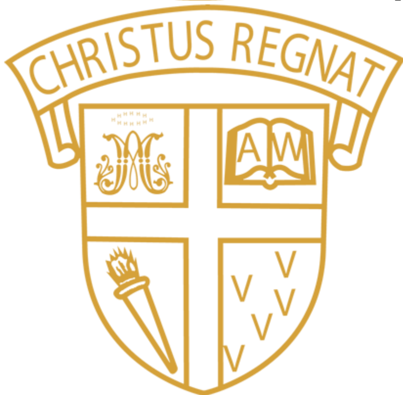
FM1614 Christus Shield