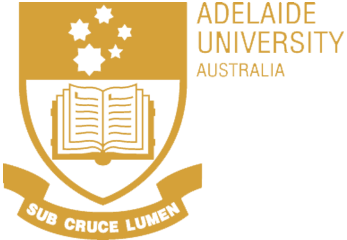
FM1596 Adelaide University