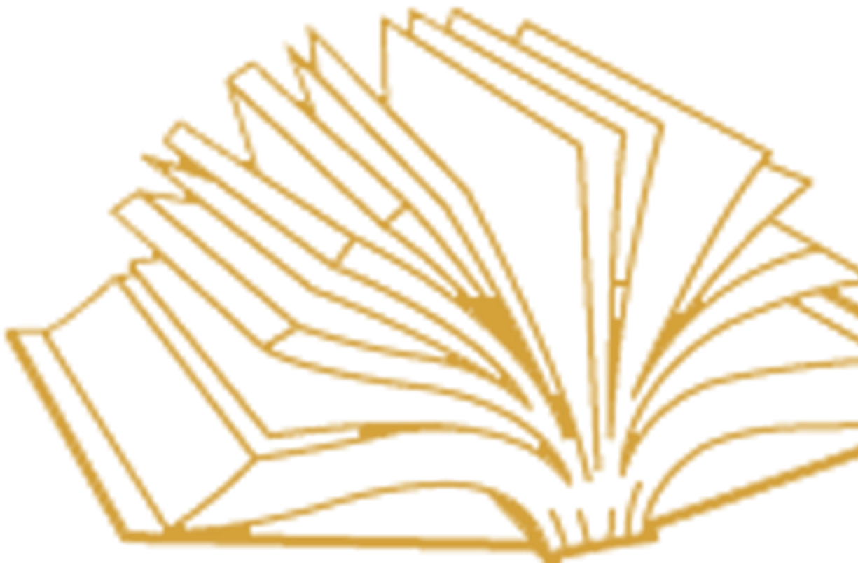
FM4766 Book Open