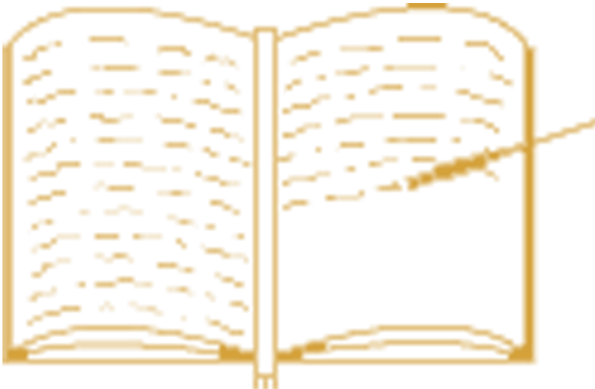
FM534 Book & Pen