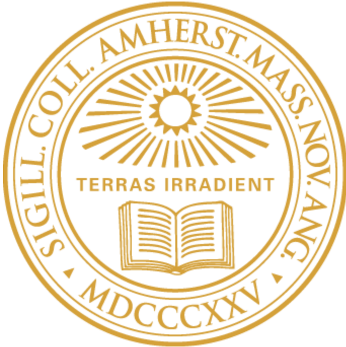
FM11883 Amherst College USA College