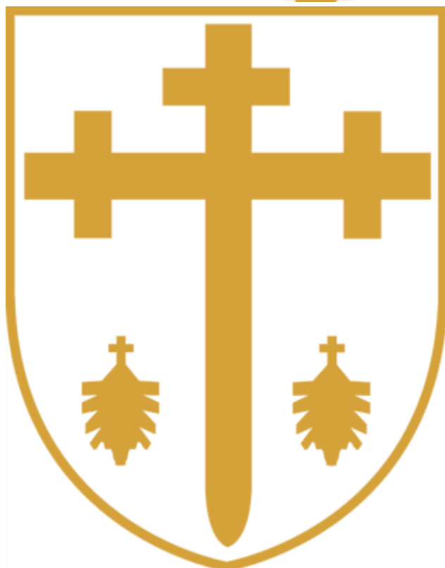
FM1607 Brighton Grammar