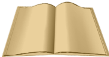
BR4289 Blank Book Bible