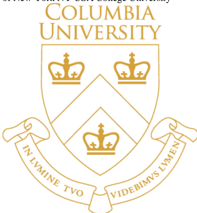
FM11889 Columbia University Shield USA