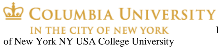
FM11890 Columbia University in the city